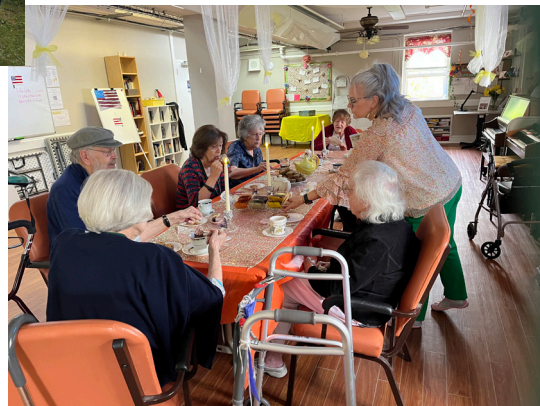
If it's Tuesday, it must be Tea Party Time!