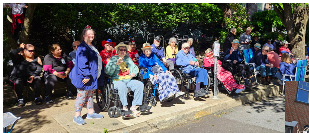
We love a parade especially the Kennett Memorial Day Parade!