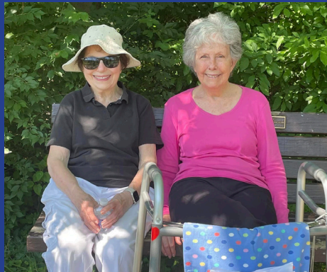
June adventures include fishing at Anson B. Nixon Park and pontooning at Marsh Creek State Park.